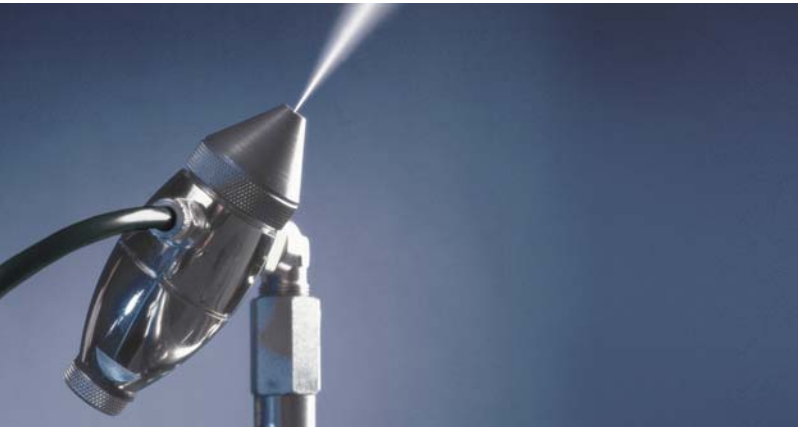
JetSpray compressed air & water humidifier