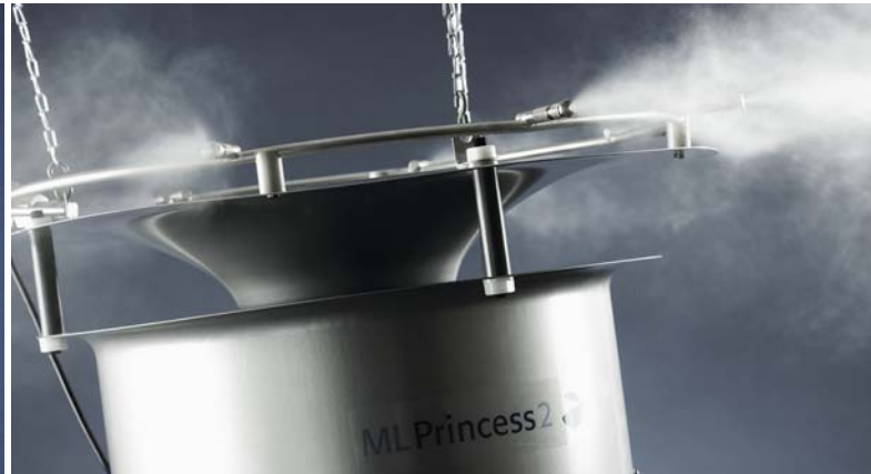
ML Princess high pressure humidifier