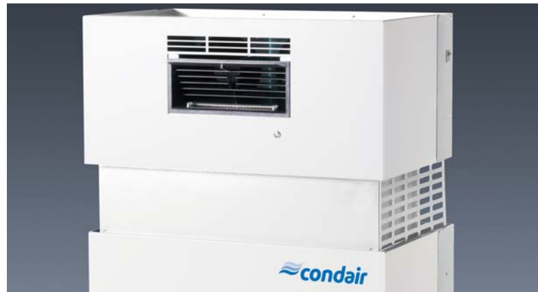
Condair CP3 steam humidifier

Condair AG Member of the Walter Meier Group Verkauf Schweiz, Talstrasse 35-37, 8088 Pfäffikon SZ Tel: +41 55 416 61 11 - info@condair.com - www.condair.com