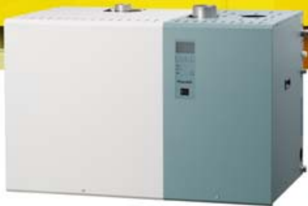
Condair GS Indoor