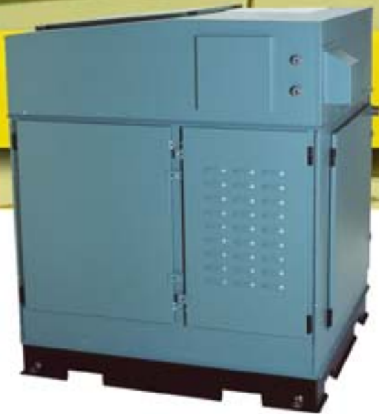
Condair GS Outdoor